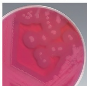
MYP agar medium https://www.fishersci.se/ shop/products/oxoid-myp-agar/ 10769413